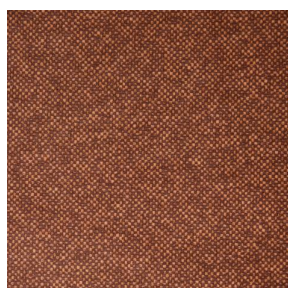
ANATOLE Chaudron 118