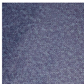
ANATOLE Océan 91