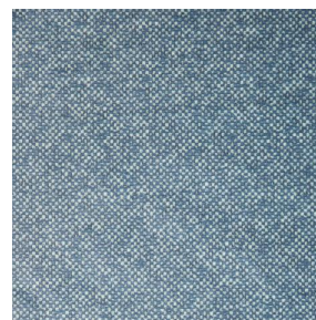
ANATOLE Celadon 135