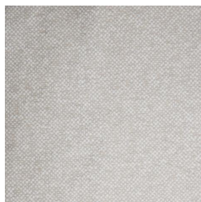
ANATOLE Naturel 26