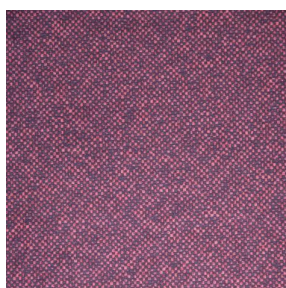
ANATOLE Amarante 108