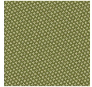
GONIDIE Mousse 92