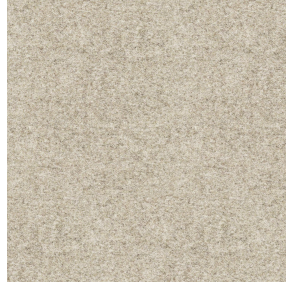
ELAINA Lin 11 Print pattern