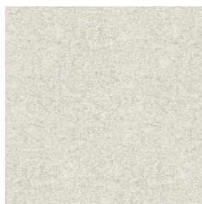
ELAINA Ivoire 115