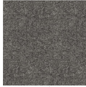
ELAINA Anthracite 38