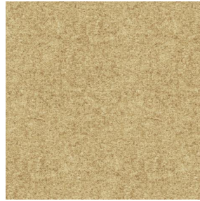
ELAINA Beige 63