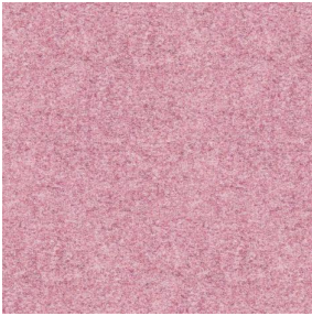
ELAINA Rose 129