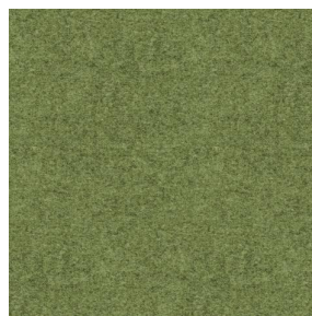
ELAINA Lierre 124