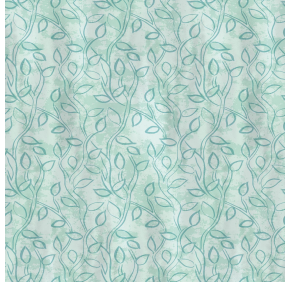
6053 Céladon 135 Print pattern