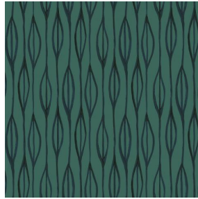
YENDI Sapin 126