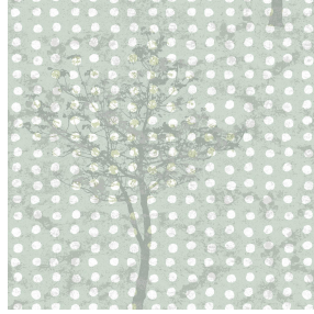
6004 Minéral 157 Print pattern