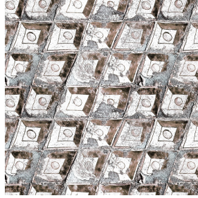
CLEMENTINA Ficelle 09 Print pattern