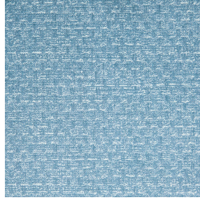
RUSTIC Glacier 43 Print pattern