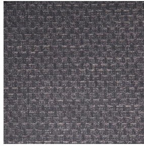
RUSTIC Titanium 98