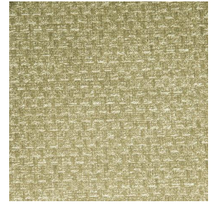
RUSTIC Bergamote 121