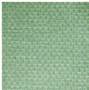
RUSTIC Prairie 125