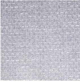
RUSTIC Lin 11