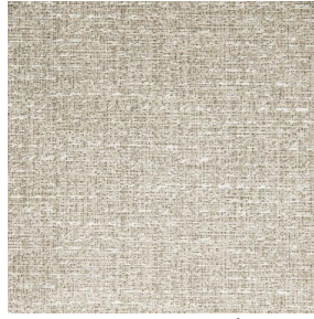
RUSTIC Naturel 26