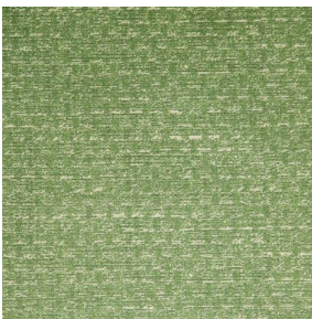
RUSTIC Mousse 92