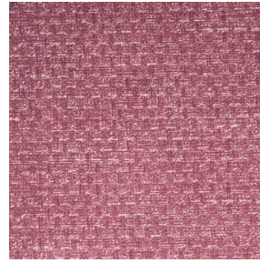
RUSTIC Hortensia 134