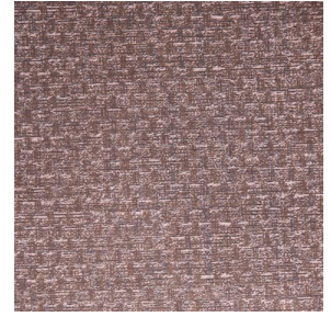
RUSTIC Terre 107