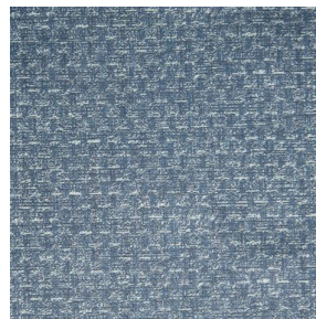
RUSTIC Bleu 41