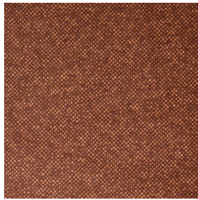
ANATOLE Chaudron 118