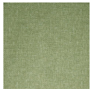
MUNA Tilleul 103