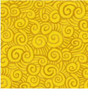
TUMULTE Mais 37