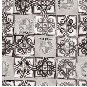
PAOLO Ficelle 09 Print pattern