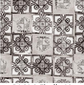
PAOLO Ficelle 09