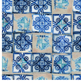
PAOLO Azur 137 Print pattern