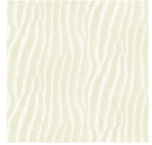
SABLE Ivoire 115