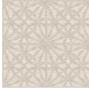
6035 Beige 63 Print pattern