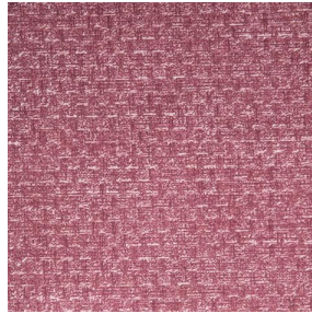
RUSTIC Hortensia 134