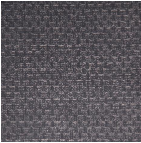
RUSTIC Titanium 98