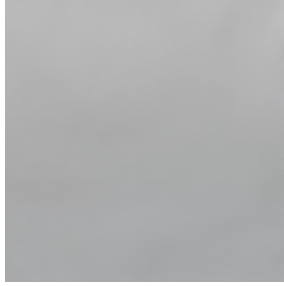
BELORA BPI 00 Printing support