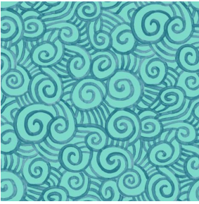
TUMULTE Menthe 122