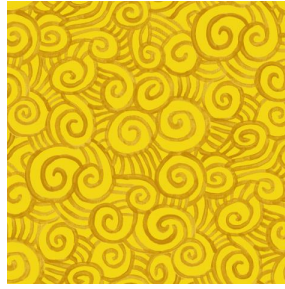
TUMULTE Maïs 37