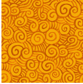
TUMULTE Safran 49 Print pattern