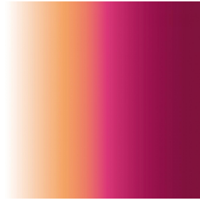
ZENITH Pivoine 57 Print pattern