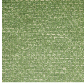
RUSTIC Mousse 92 Print pattern