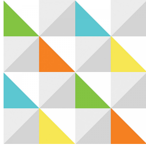
VICTORIEN multico 98 Print pattern