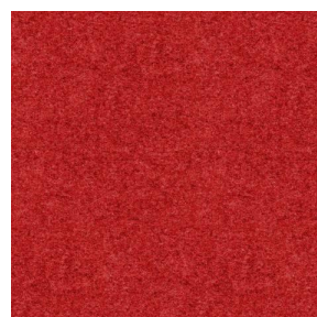
ELAINA Rouge 21