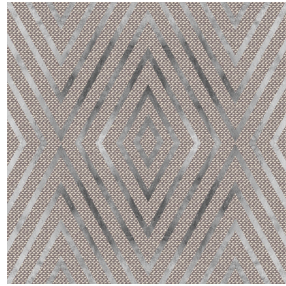
ECHO Lin 11 Print pattern