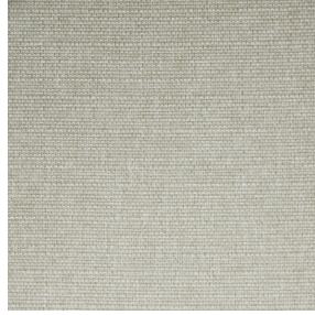
MUNA Coco 142 Print pattern