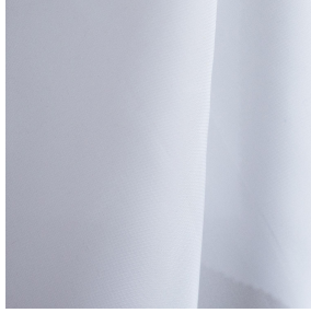
3141 bpi 00 Printing support