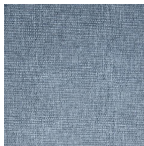
MUNA Tourterelle 138