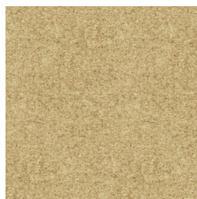
ELAINA Beige 63