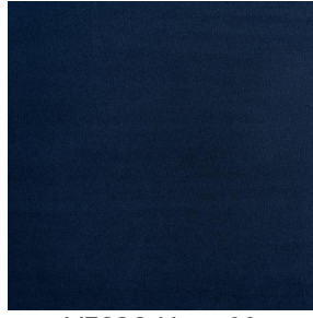
VESSO Navy 09