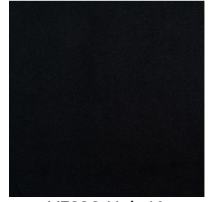
VESSO Noir 10