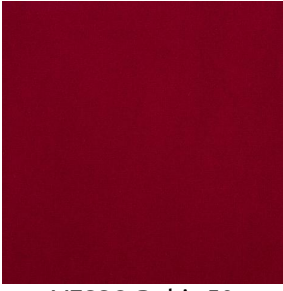
VESSO Rubis 59