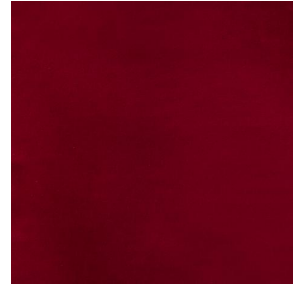
VELAOS Rouge 21