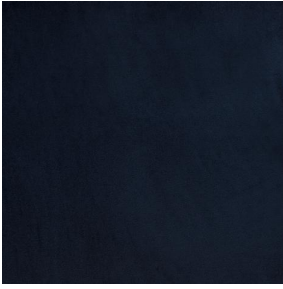
VELAOS Navy 09