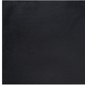
VELAOS Acier 19