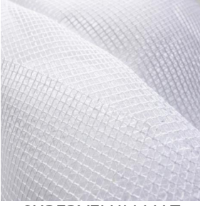
SUPERVELUM MAT Blanc 01