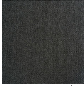
SIENTO WOODY Poivre 181