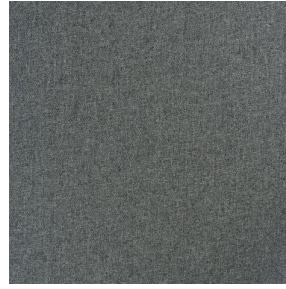
SIENTO RECYCLE UNI Acier 18