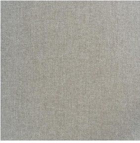
SIENTO RECYCLE UNI Lin 11