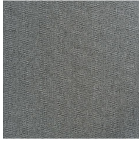
SIENTO RECYCLE UNI Ficelle 09