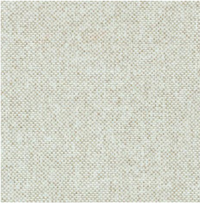
SIENTO RECYCLE UNI Naturel 26