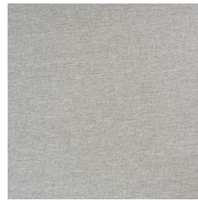
SIENTO LITO Lin 11