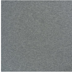
SIENTO LITO Souris 31