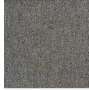
SIENTO LITO Minéral 157