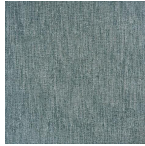
SIENTO LITO Poireau 162