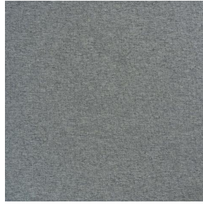
SIENTO LITO Souris 31