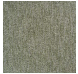
SIENTO LITO Lichen 156