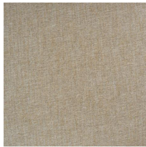
SIENTO LITO Sahara 169