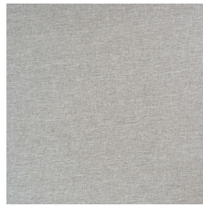
SIENTO LITO Lin 11