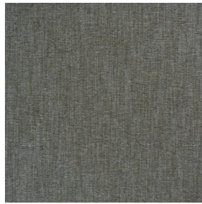
SIENTO LITO Kaki 148