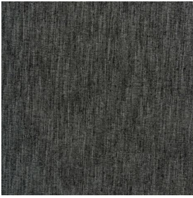
SIENTO LITO Poivre 181