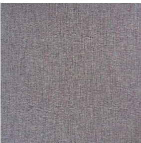
SIENTO LITO Lilas 19