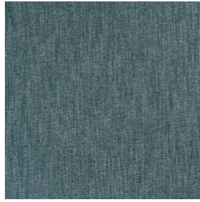
SIENTO LITO Sapin 126