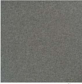
SIENTO LITO Girofle 186