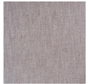
SIENTO LITO Hortensia 134