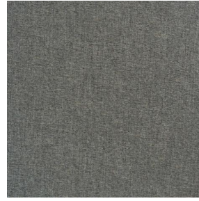
SIENTO LITO Taupe 95