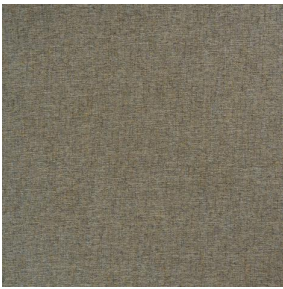
SIENTO LITO Cuivre 50