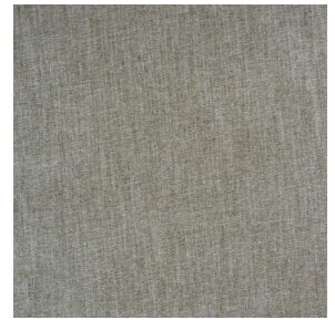
SIENTO LITO Brousse 192