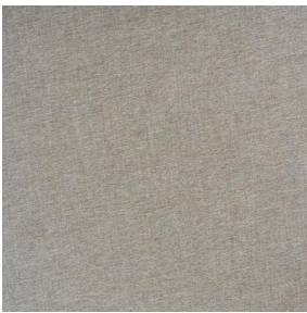
SIENTO LITO Cordage 172