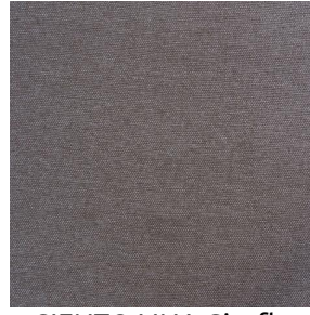
SIENTO LINA Girofle 186