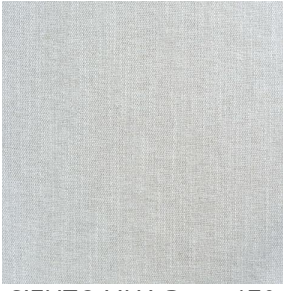
SIENTO LINA Dune 170