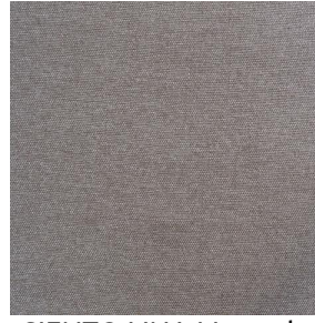
SIENTO LINA Muscade 175