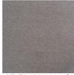
SIENTO LINA Muscade 175