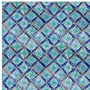
PIETRO Azur 137