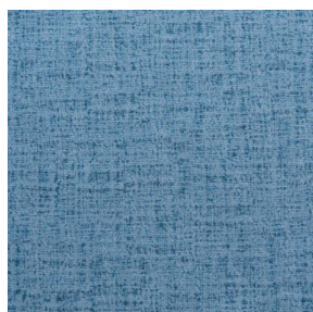
NOCTURNE MURA 2334 Glacier 43