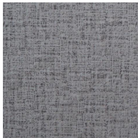
NOCTURNE MURA 2334 Minéral 157