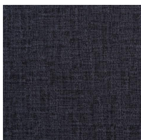
NOCTURNE MURA 2334 Fusain 71