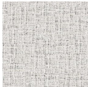
NOCTURNE MURA 2334 Mastic 48