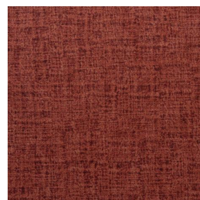
NOCTURNE MURA 2334 Grenat 56