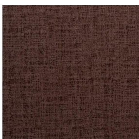
NOCTURNE MURA 2334 Terre 107