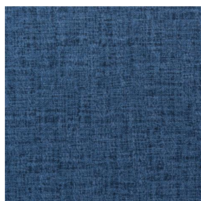
NOCTURNE MURA 2334 Saphir 106