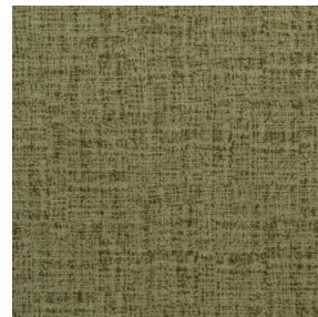
NOCTURNE MURA 2334 Olive 61