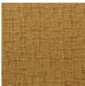
NOCTURNE MURA 2334 Savane 185