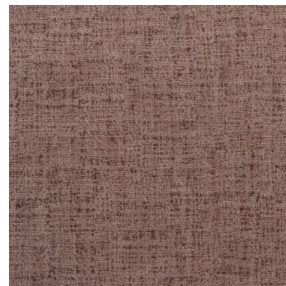
NOCTURNE MURA 2334 Dune 170