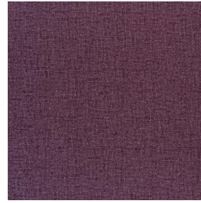
NOCLIN MURA 2334 Cassis 97