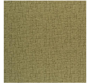
NOCLIN MURA 2334 Olive 61