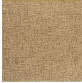
NOCLIN MURA 2334 Dune 170