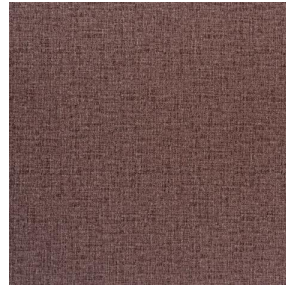
NOCLIN MURA 2334 Terre 107