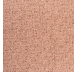
NOCLIN MURA 2334 Rose 129