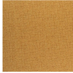
NOCLIN MURA 2334 Savane 185