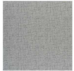
NOCLIN MURA 2334 Minéral 157