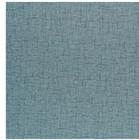
NOCLIN MURA 2334 Glacier 43