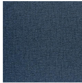
NOCLIN MURA 2334 Saphir 106