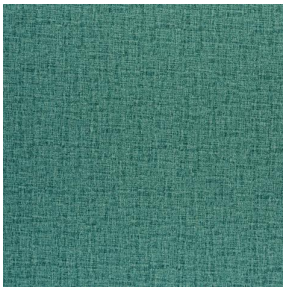
NOCLIN MURA 2334 Turquoise 53