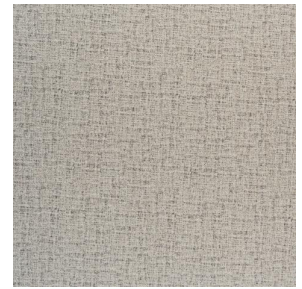
NOCLIN MURA 2334 Mastic 48