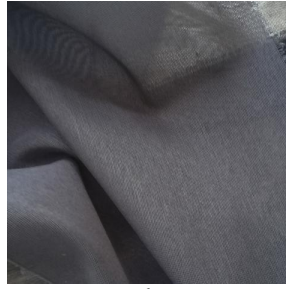
M102 anthracite 38