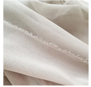
M102 lin 11