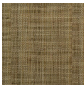
COMET RAPHIA 2351 Chamois 111