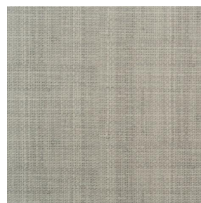
COMET RAPHIA 2351 Galet 147