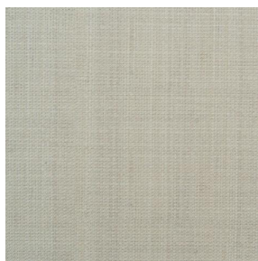
COMET RAPHIA 2351 Lin 11