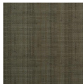
COMET RAPHIA 2351 Kaki 148