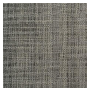
COMET RAPHIA 2351 Gris 97