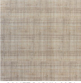
COMET RAPHIA 2351 Sable 67