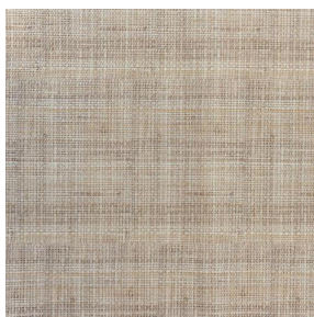
COMET RAPHIA 2351 Sable 67