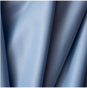
BIOTAM Lavande 89