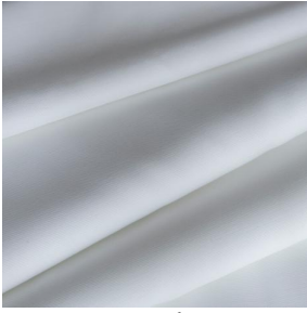
BIOTAM Blanc 01