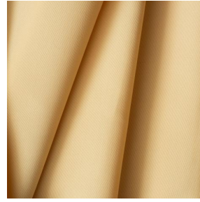
BIOTAM Mais 37