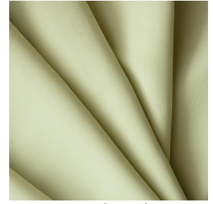
BIOTAM Absinthe 132