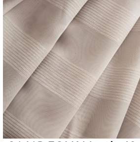
3141R FOLK Mastic 48