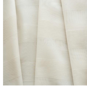
3141R FOLK Nacre 203