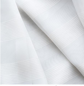
3141R FOLK Blanc 01