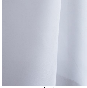
3141 bpi 00