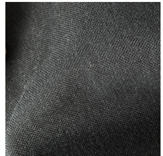
VICTOR NOIR 10 Noir 10 / Woven patterns (Jacquard)