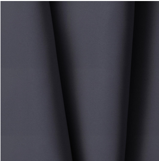
BOREAL ACIER 18 Acier 18 / Plain