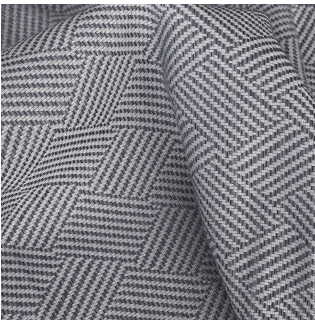
TOSCANE JOE TAUPE 95 Taupe 95 / Woven patterns (Jacquard)