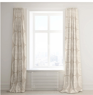
ANGELE SABLE 67 Sable 67 / Printing design