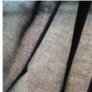
ETAMINE NOIR 12 Noir 12 / Plain Curtain