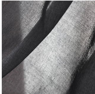
ETAMINE ANTHRACITE 38 Anthracite 38 / Plain Curtain