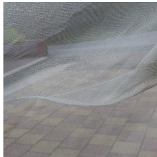
ORGANZA NATUREL 26 Naturel 26 / Plain Curtain