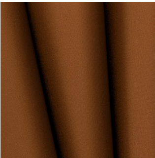
OPALE 2 BRUN 23 Brun 23 / Plain