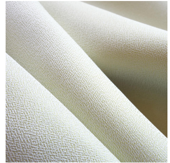
METALU COQUILLAGE 35 Coquillage 35 / Woven patterns (Jacquard)