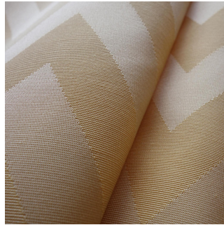
BEN NATUREL 26 Naturel 26 / Woven patterns (Jacquard)