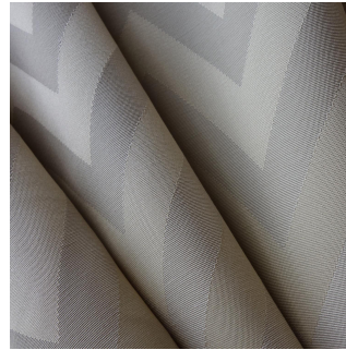
BEN CHAMOIS 111 Chamois 111 / Woven patterns (Jacquard)