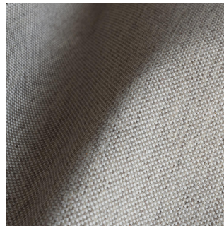
VICTOR FICELLE 09 Ficelle 09 / Woven patterns (Jacquard)