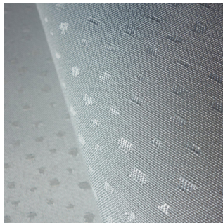
FRIMAS GLACIER 43 Glacier 43 / Woven patterns (Jacquard)