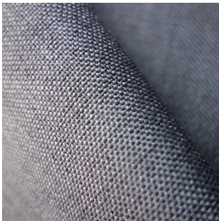
BOHEME GRIS 97 Gris 97 / Plain