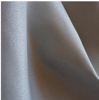
METALU ARGENT 73 Argent 73 / Woven patterns (Jacquard)