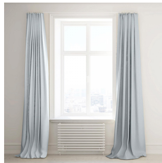
CHARLOTTE SOURIS 31 Souris 31 / Printing design