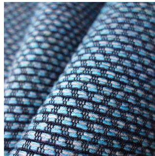
TOSCANE MATI BRUME 47 Brume 47 / Woven patterns (Jacquard)