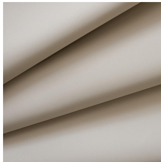
NOCTIS UNI MASTIC 48 Mastic 48 / Plain