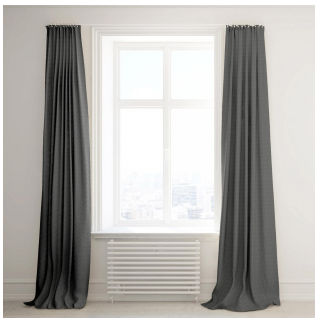
RIVE TAUPE 95 Taupe 95 / Printing design