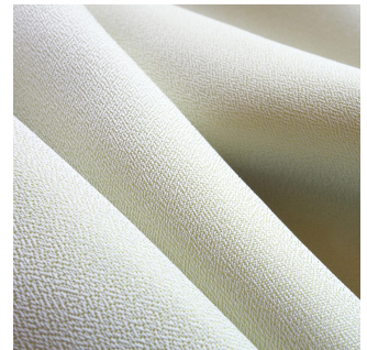
METALU COQUILLAGE 35 Coquillage 35 / Woven patterns (Jacquard)