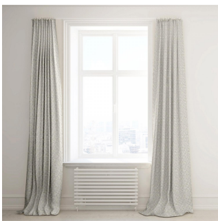
SALIN NATUREL 26 Naturel 26 / Printing design